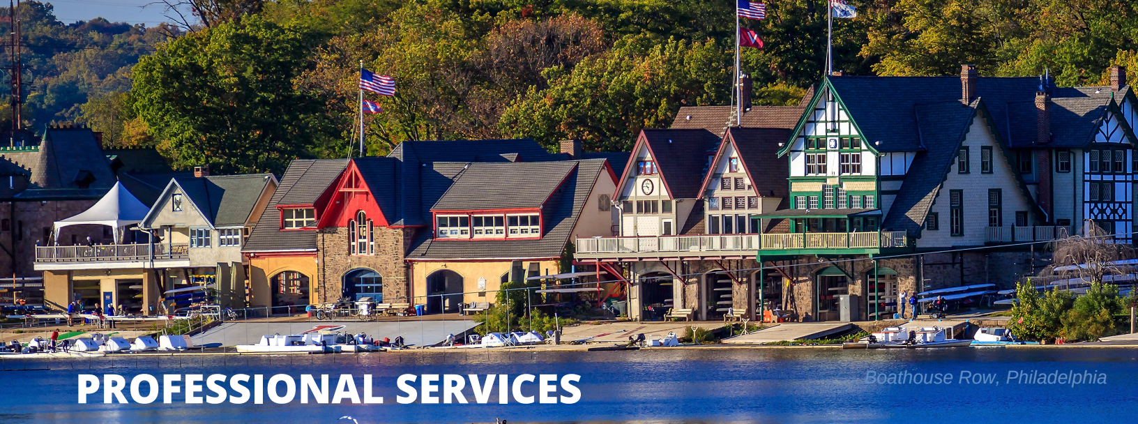
Boathouse Row, Philadelphia