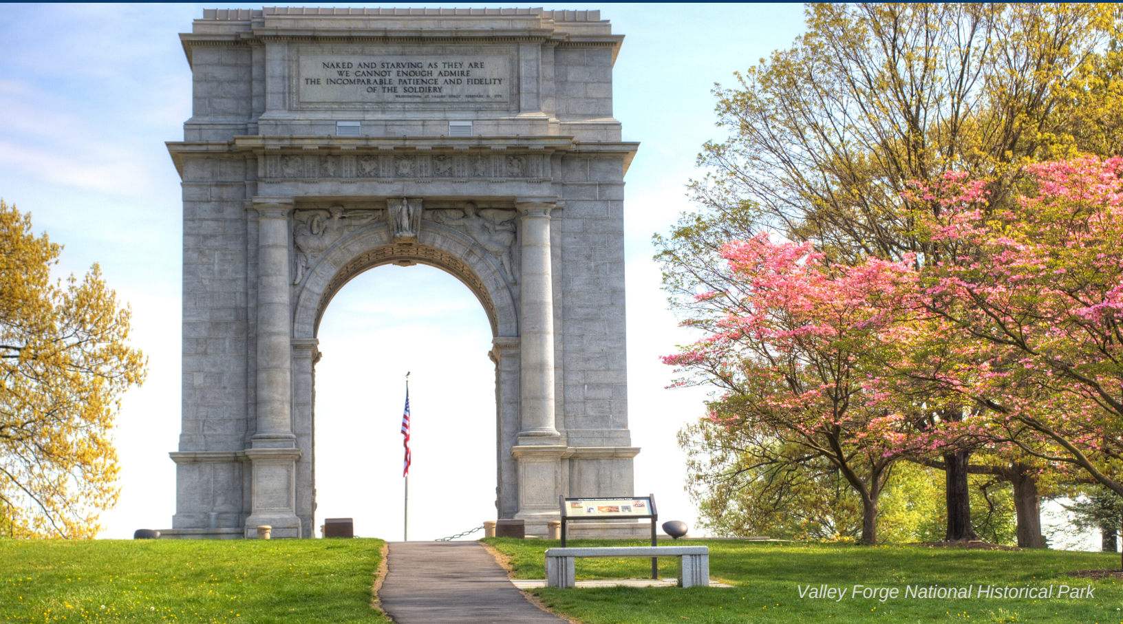
Valley Forge National Historical Park